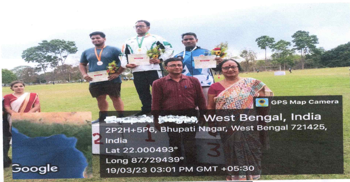
Certificate Distrubution Ceremonv