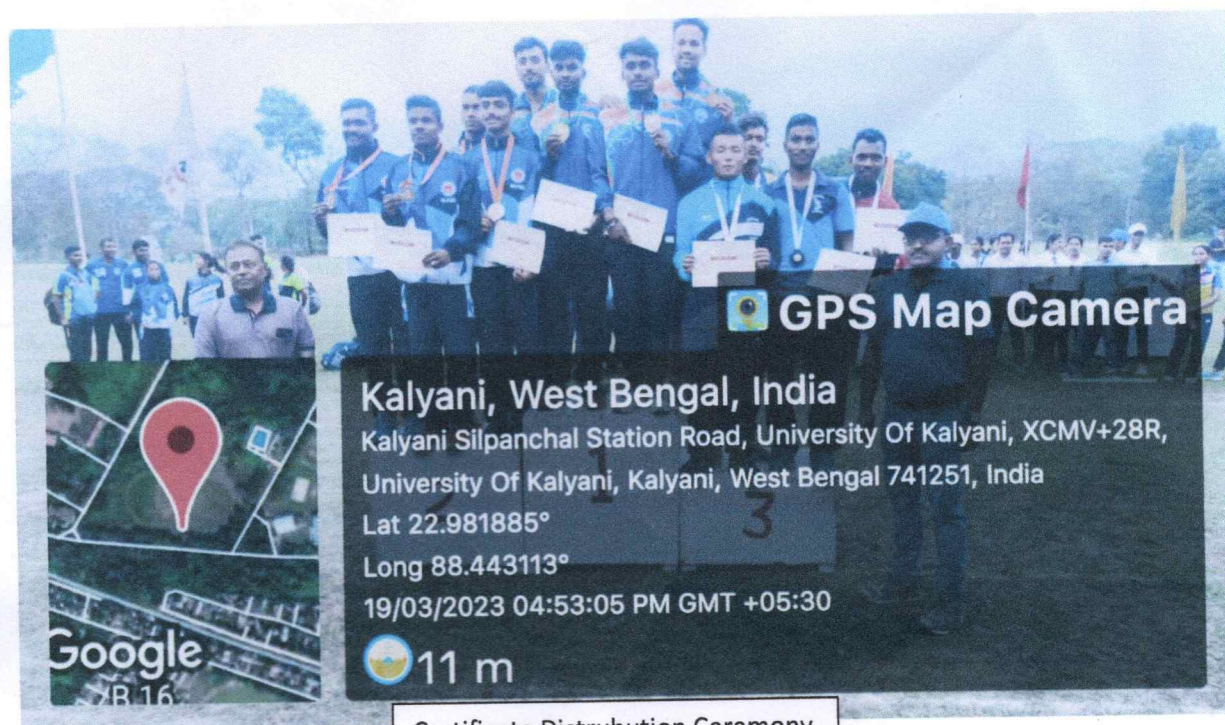
Certificate Distrubution Ceremonv