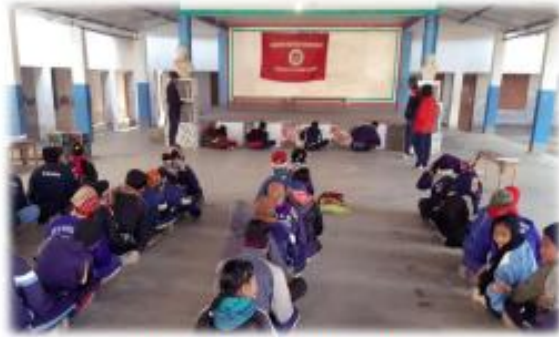
Drawing Relay contest